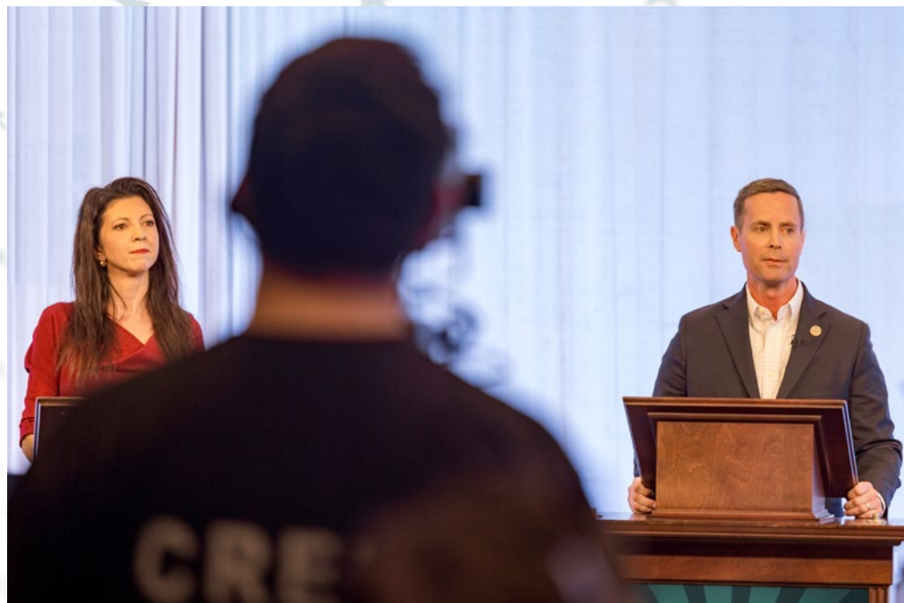
Betsy Dirksen Londrigan and Rodney Davis in the WILL-TV studio.