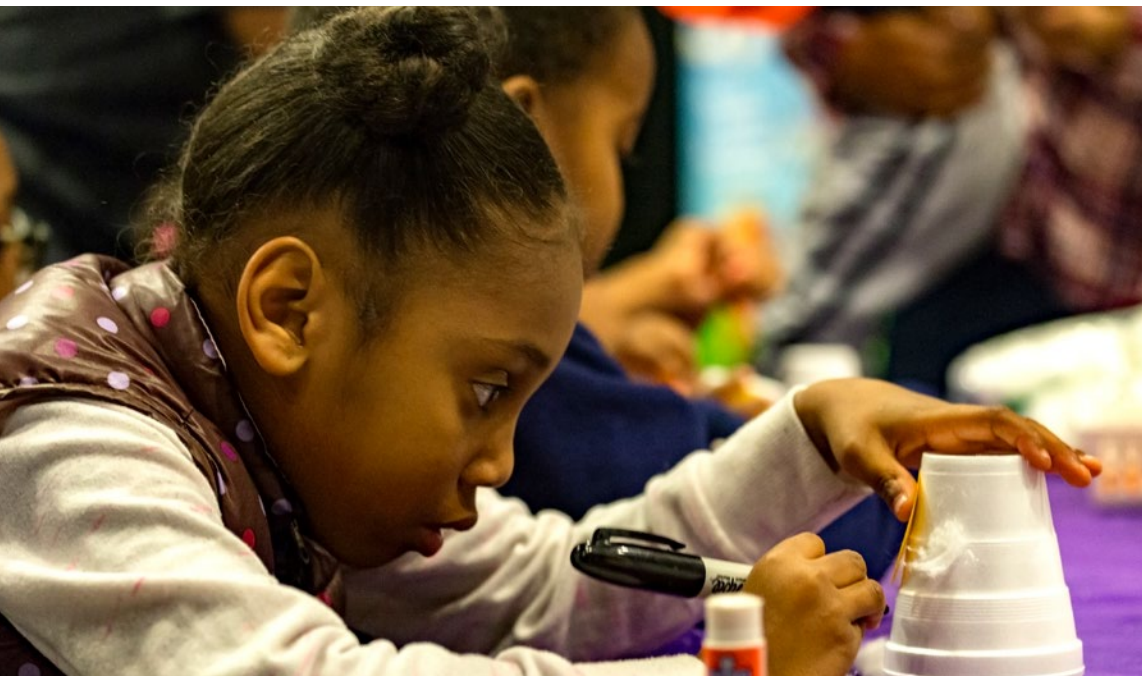
Book Mentor Family Night in the WILL-TV studio.