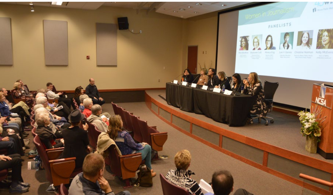
Women in Journalism kicked off a year-long celebration of the 45th anniversary of the Friends of WILL.

In November, we hosted a conference to celebrate women in journalism. The event focused on what has changed for women in the industry, what still needs to change, and what the future may hold with more women pursuing the field than ever before.