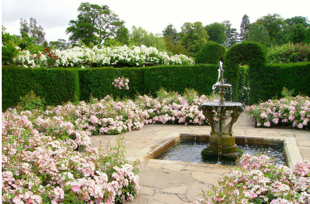
Hever Castle Gardens

Free time for lunch is provided before we gather again to drive to Sheffield Park Garden, owned by the National Trust. The park was originally designed by Lancelot “Capability” Brown in the 18th century and later expanded by the home’s various owners. Four ponds with water lilies form the garden centerpiece surrounded by