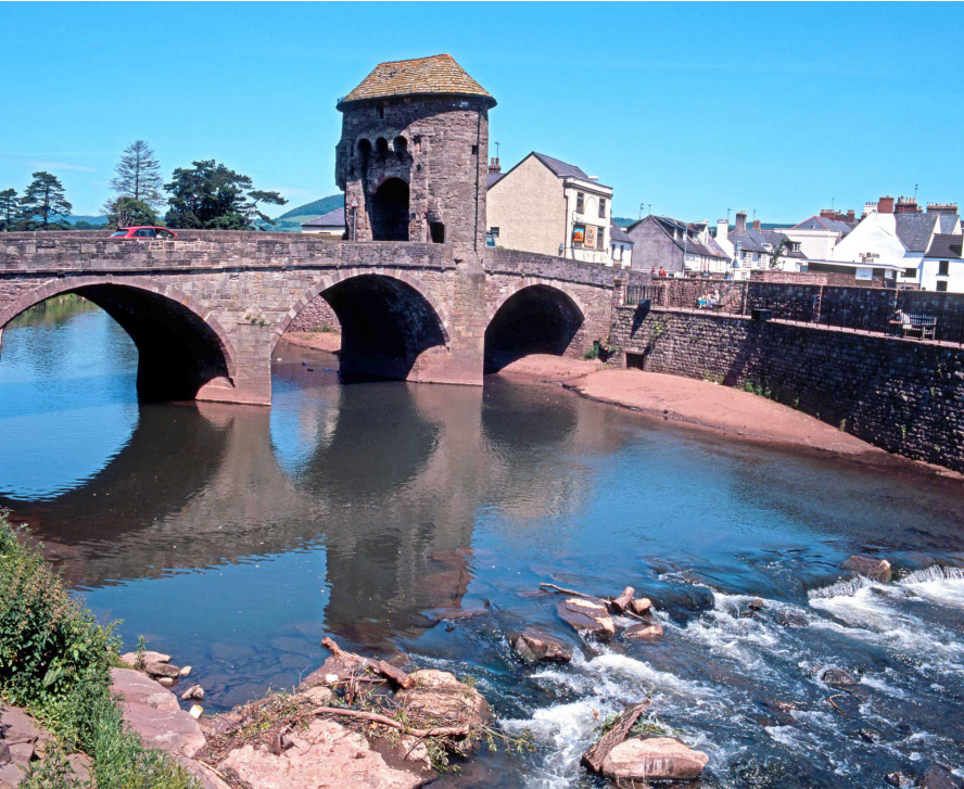
Monmouth's fortified bridge in Wales

Afterwards we have time in the Cotswolds village of Burford and then enjoy an included dinner in the Venice of Britain, Bourton-on-the-Water. We then return to Ellenborough Park. (B, T, D)