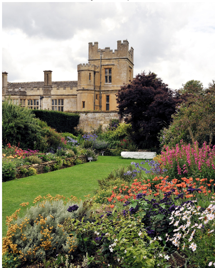
In the Cotswolds: 15th century Sudeley Castle's secret garden. It is still a residence and the only private castle to have a queen buried in its grounds. We plan to have tea here.