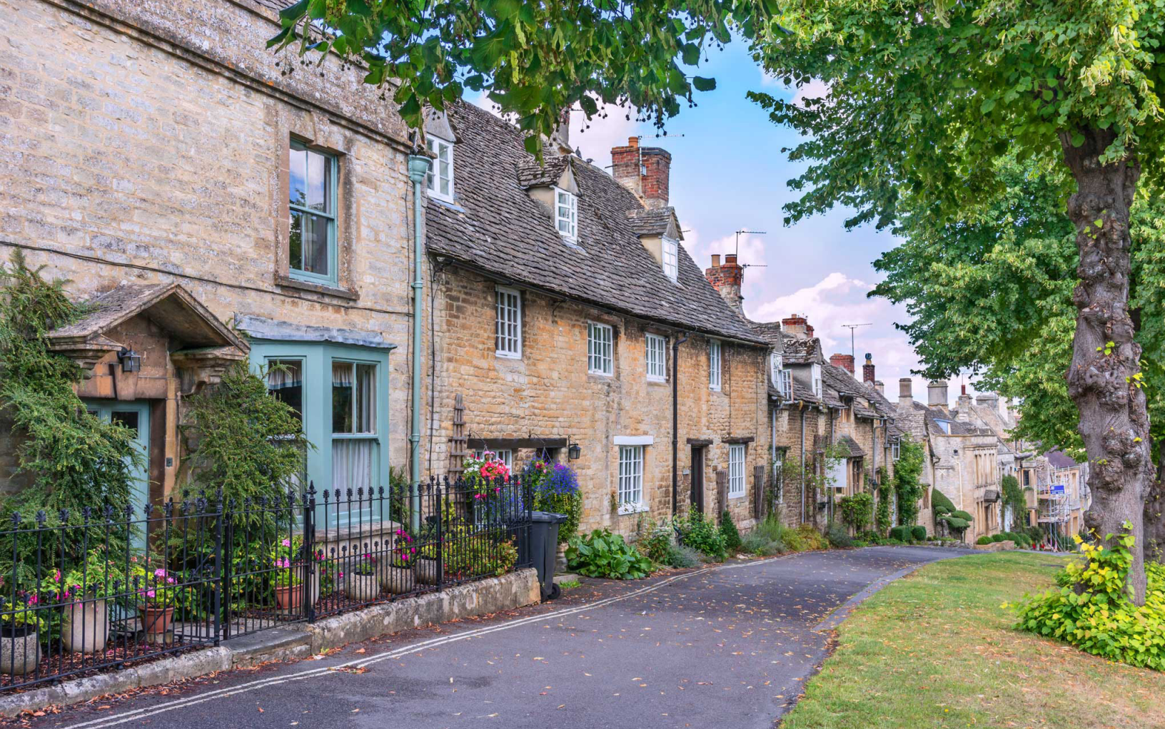
The Cotswolds, charming villages made of honey-coloured stone