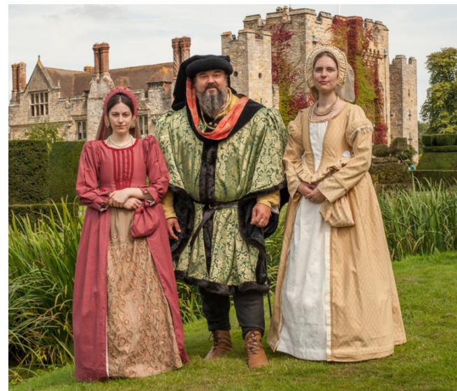
Above: the original Leeds Castle was wooden and owned by a Saxon chief from 857; below: a royal welcome at Hever Castle.