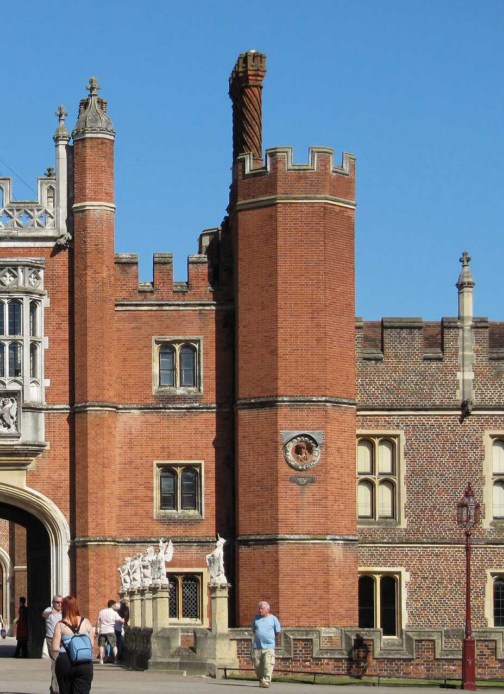
The Great Gate of Hampton Court