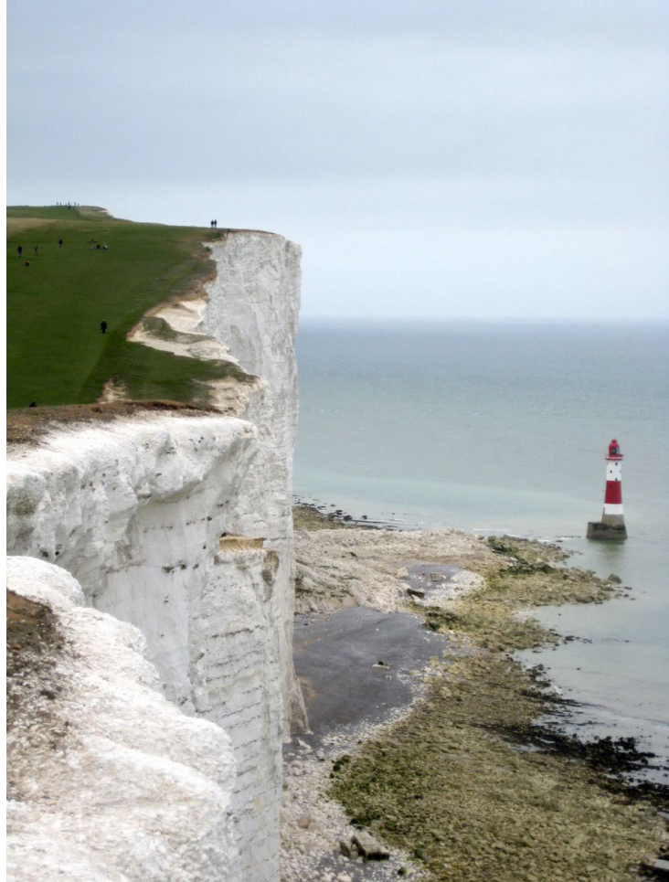
The Beachy Head Lighthouse near Eastbourne on the English Channel