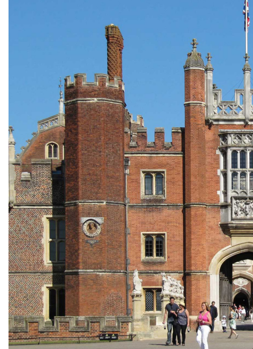
Penshurst Place, a hunting lodge for Henry VIII was convenient for courtship being only a few miles from Hever Castle, childhood home of Henry's second wife Anne Boleyn.

Once revived we head to Penshurst Place and Gardens for a private tour of this stately home built in 1341. Penshurst was reportedly Henry VIII's favorite hunting lodge; Henry visited often when besotted by Anne Boleyn, who lived at nearby Hever Castle. Penshurst was used in the MASTERPIECE adaptation of Hilary Mantel's novel Wolf Hall . The Queen Elizabeth Room, The Tapestry room, The Solar, The Long Gallery and The Crypt were all used in filming – to create a perfect Tudor period setting.