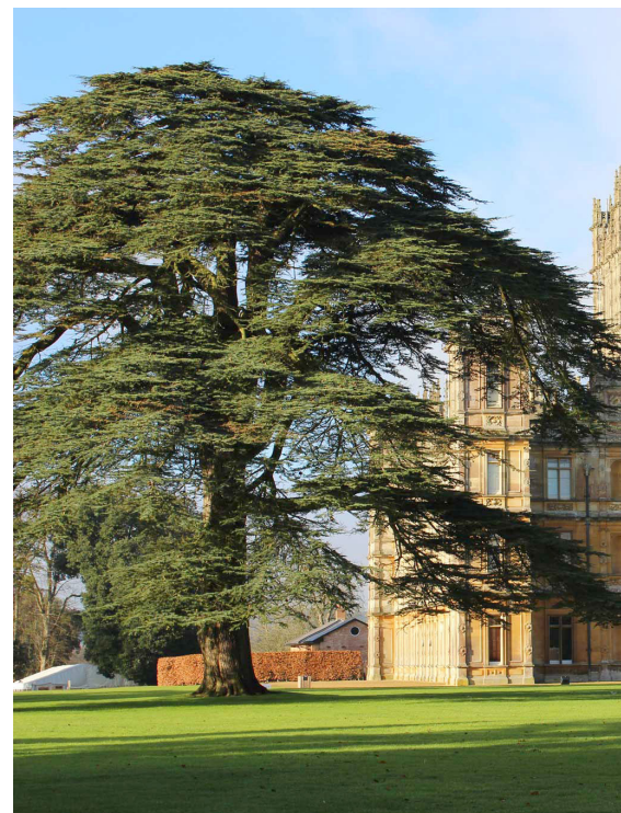
Highclere Castle in the Cotswolds was the location for Downton Abbey

We continue on to Highclere Castle, which was made famous as the setting of Downton Abbey. Your admission will give you free time to wander about this still-private home.