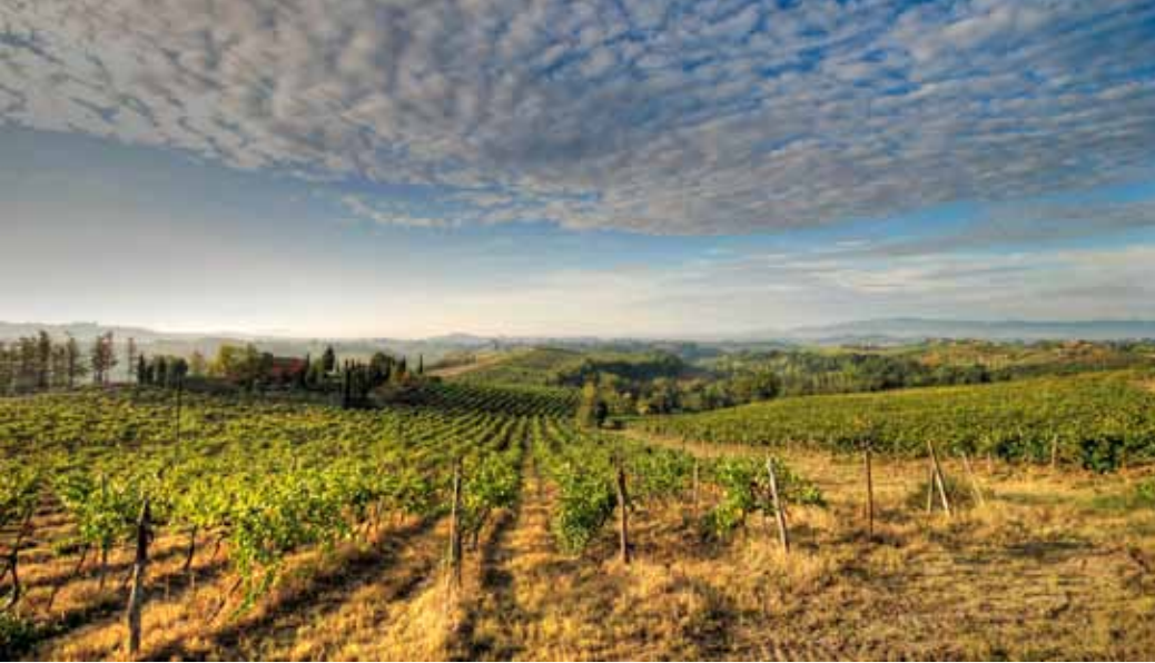
Vineyard in Chianti

sent wine to England;” the local wine “Chianti Classico” officially dates back to 1716 and was made in squat bottles nestled in straw baskets. Overnight in Radda in Chianti.