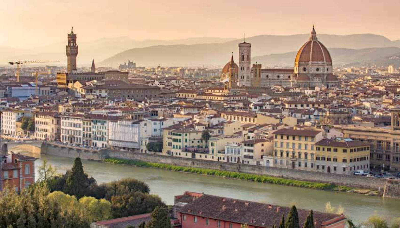
Florence's River Arno

home. We head back to Radda in Chianti a little early this afternoon for some free time to have a bit of dolce far niente (delicious idleness) while overlooking the Tuscan countryside. Overnight in Radda in Chianti. (B)