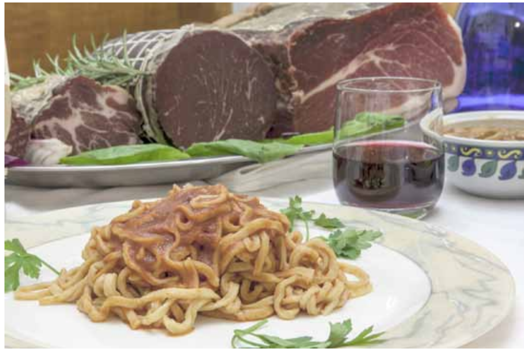
Strangozzi-al-suzo, Umbrian recipe

Physical Requirements: travel in Italy requires more walking, steps and inclines that could be difficult or impossible for those with physical limitations. You need to consider whether you can accept that this may make you miss parts of the tour and stay at the hotel and be on your own. Each of our hotels has elevators. Even so, the first, a manor house dating from the 1700s, has sections (dining room, pool, some rooms) accessible only by a set of approximately ten steps. This is our trade-off for being in an idyllic setting.