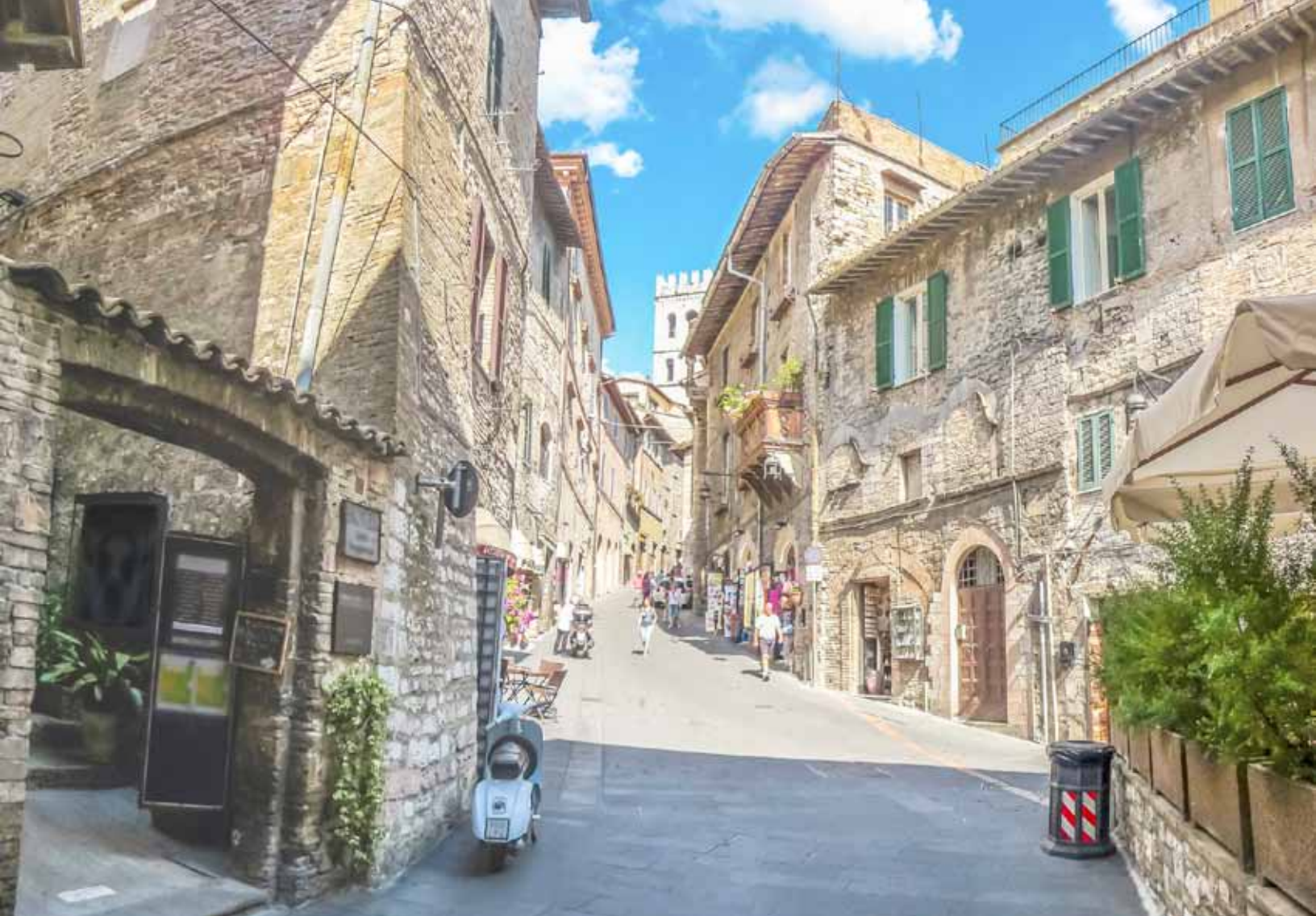
Above & below: Assisi

of Two Worlds has been held in mid-summer since 1958. We continue southwest and arrive at the eternal city of Rome. Overnight in Rome. (B)