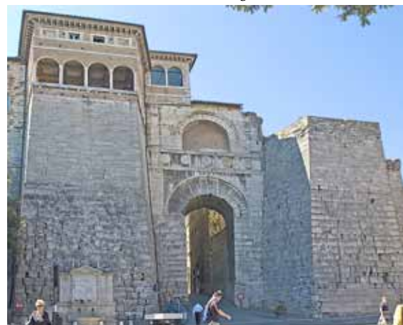
Above: Tuscany; Below: Etruscan Arch in Perugia, Umbria

Pienza. After mountainous, inland Perugia, Assisi and Spoleto, we proceed to the Eternal City of Rome. Space is limited! Don't delay, most tours fill up early.