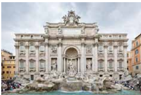
Trevi Fountain, Rome