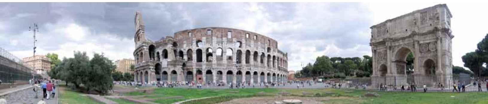
Hadrian's Arch & the Colosseum, Rome