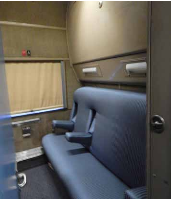
Above: Daytime in a Birch Grove Double Bedroom; below: Facilities