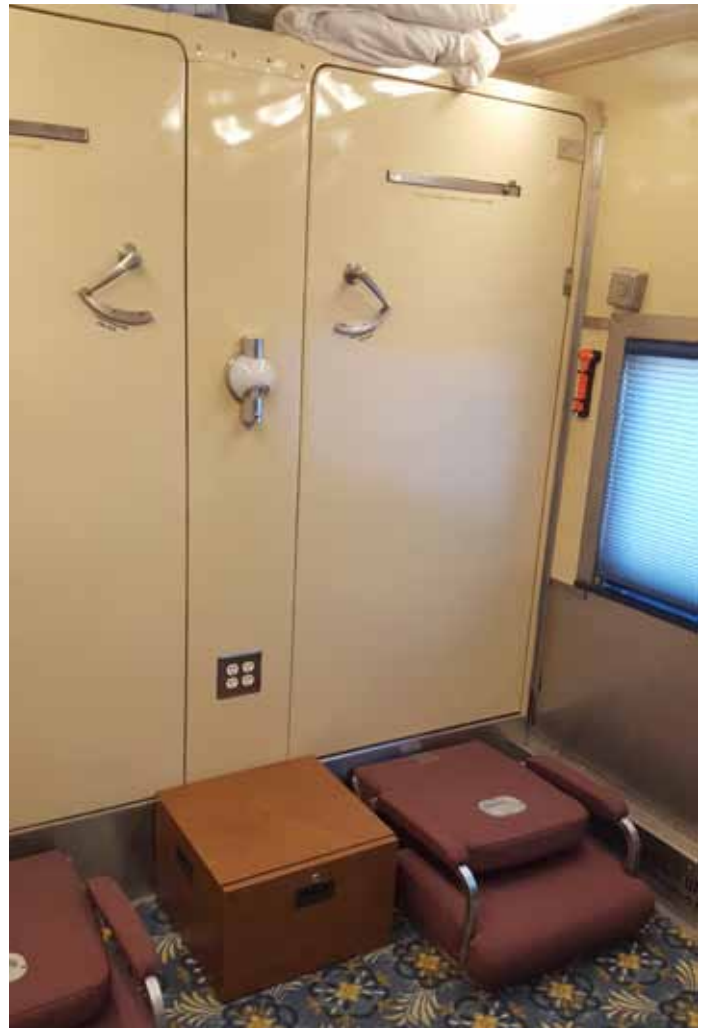
Above: Daytime in a Dome room with 2 lower beds; below: at night