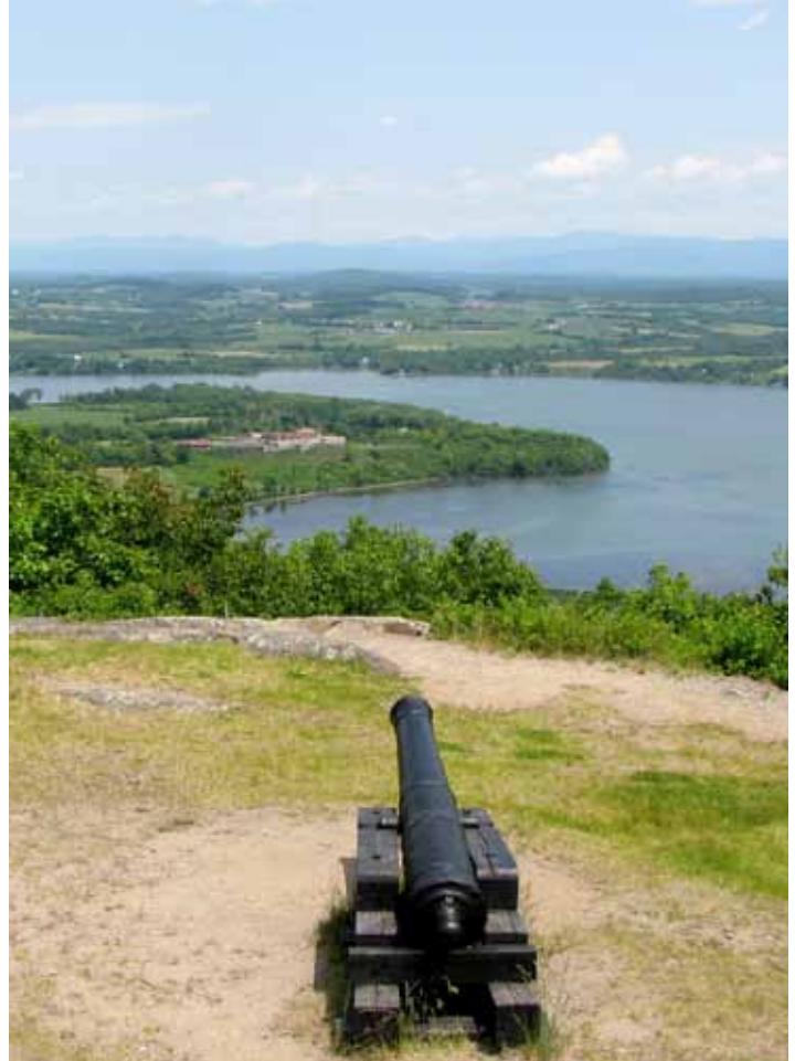
View from Mount Defiance showing Fort Ticonderoga, center, on Lake Champlain