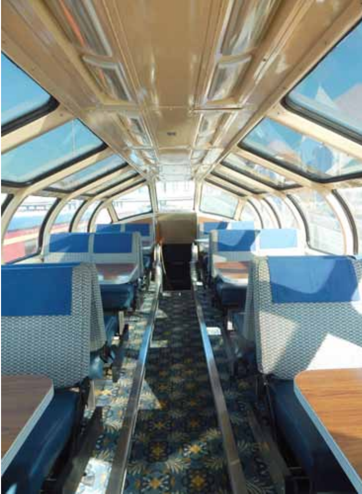
View from the Moonlight Dome car